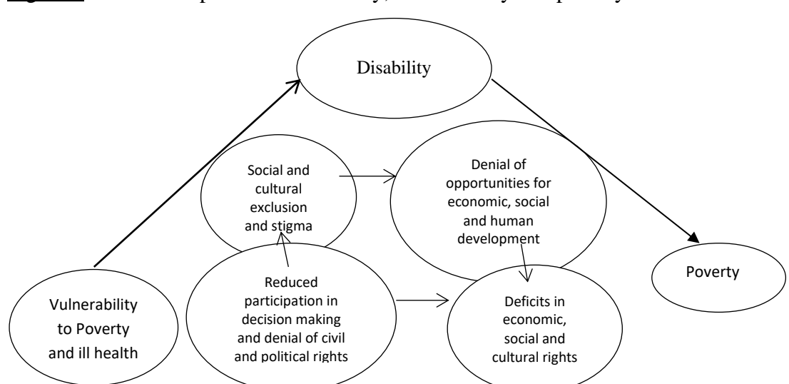
Figure 1: Relationship between disability, vulnerability and poverty